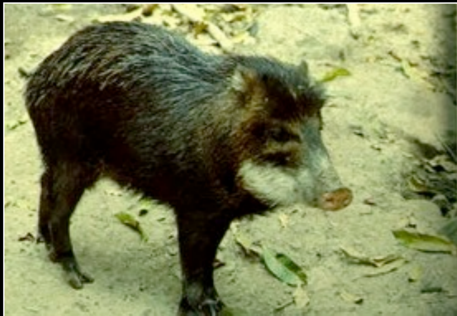
White-lipped Peccary Tayassu pecari Peccary Family TAYASSUIDAE