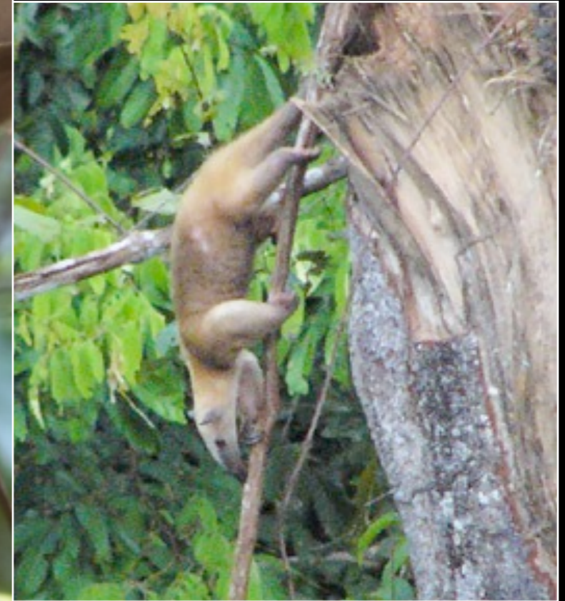
Collared Anteater or Southern Tamandua Tamandua tetradactyla Anteater Family MYRMECOPHAGIDAE