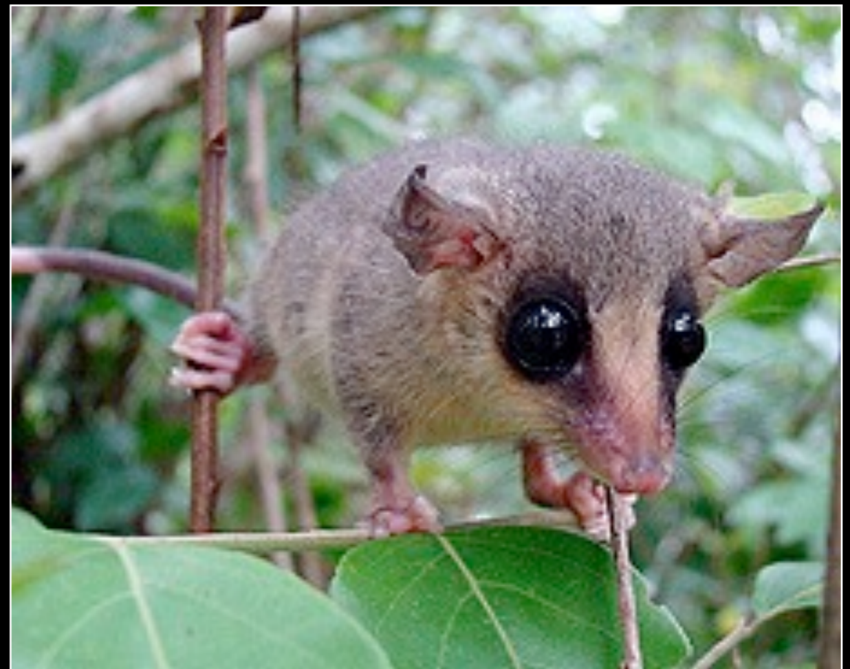
Agile Gracile Mouse Opossum Gracilinanus agilis Opossum Family DIDELPHIDAE