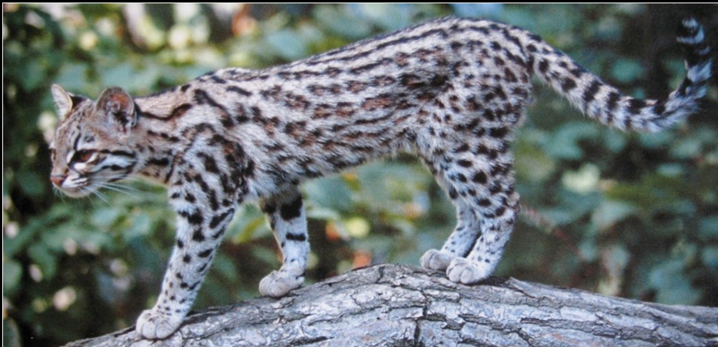
Oncilla or Little Spotted Cat Leopardus tigrinus Cat Family FELIDAE