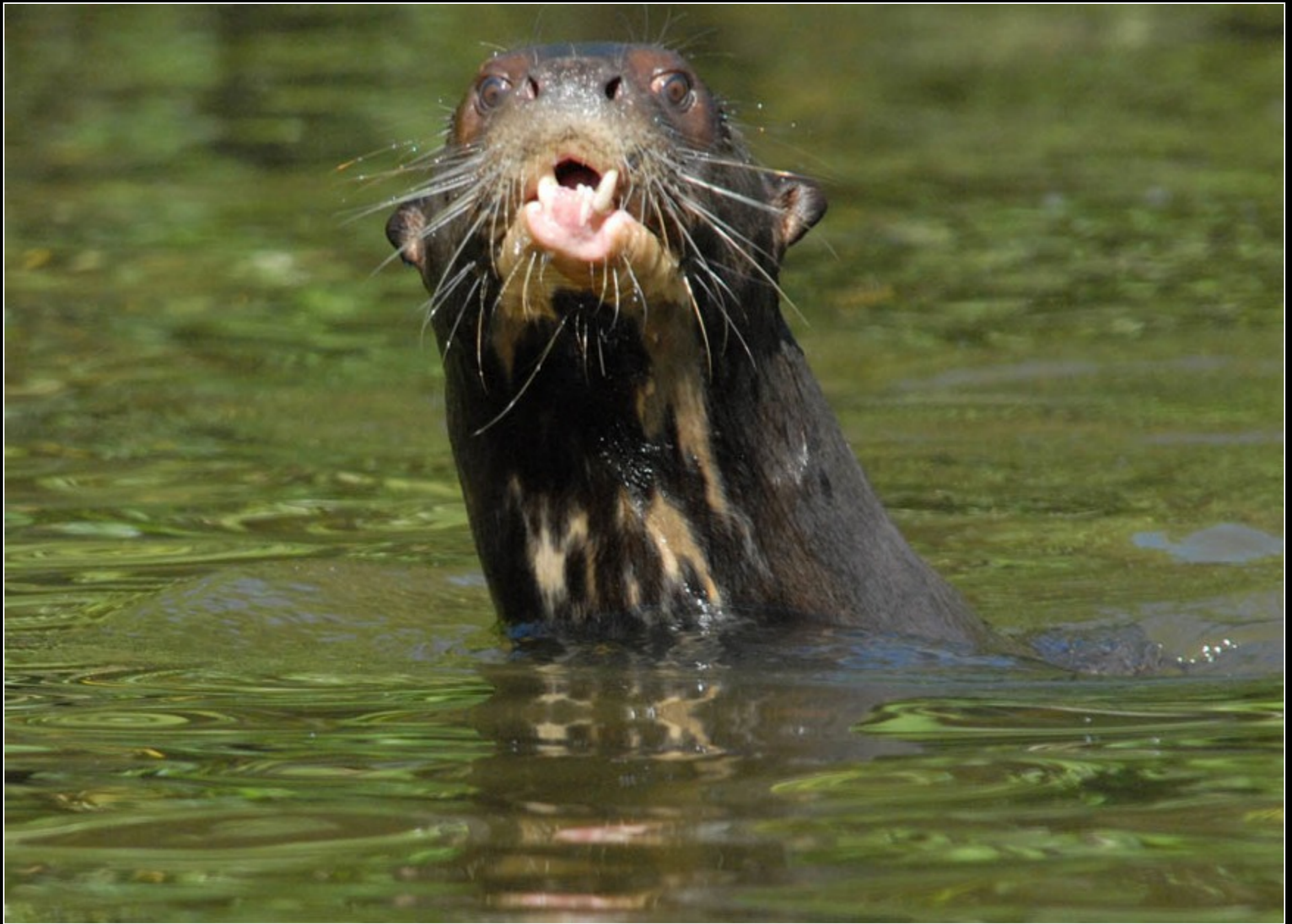
Giant Otter Pteronura brasiliensis Weasel Family MUSTELIDAE