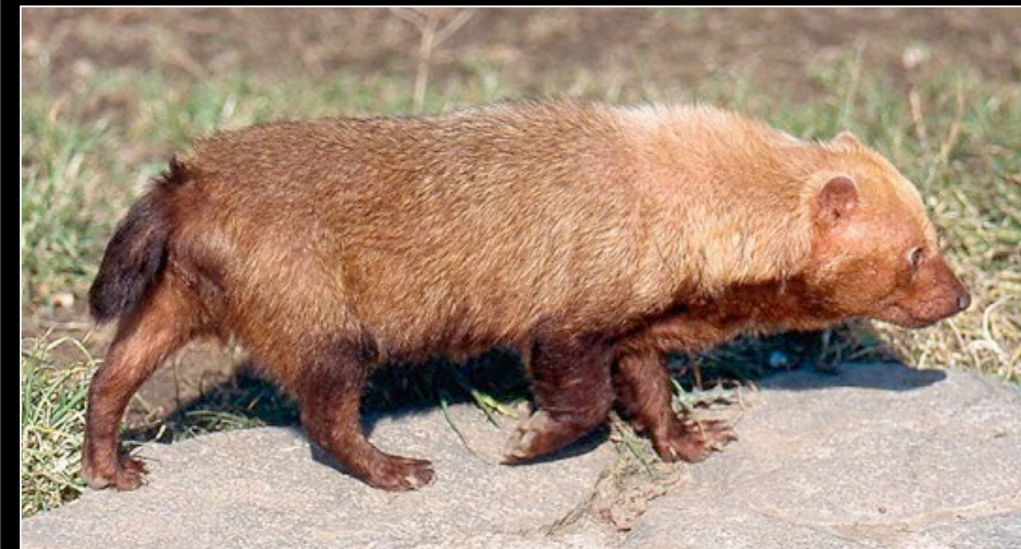
Bush Dog Speothos venaticus Dog Family CANIDAE