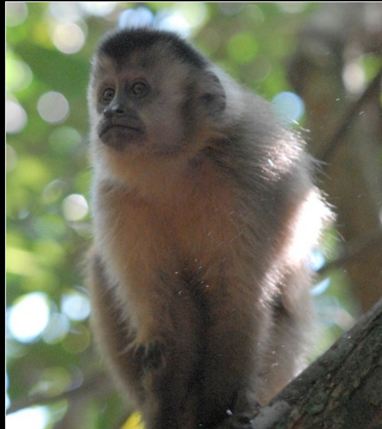
Brown Capuchin Cebus apella Monkey Family CEBIDAE