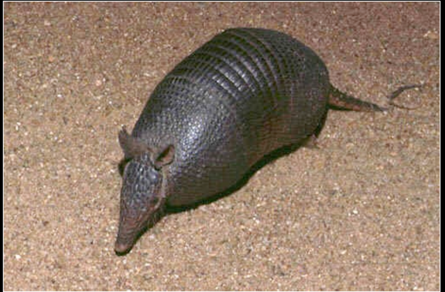
Seven-banded Armadillo Dasylops septemcinctus Armadillo Family DASYPODIDAE