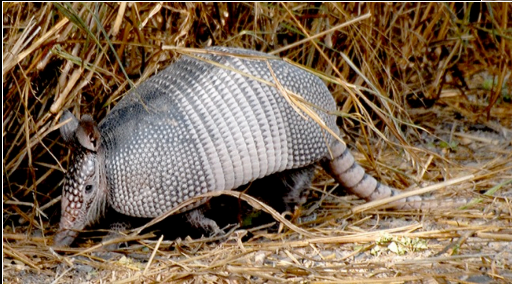
Nine-banded Armadillo Dasypus novemcinctus Armadillo Family DASYPODIDAE