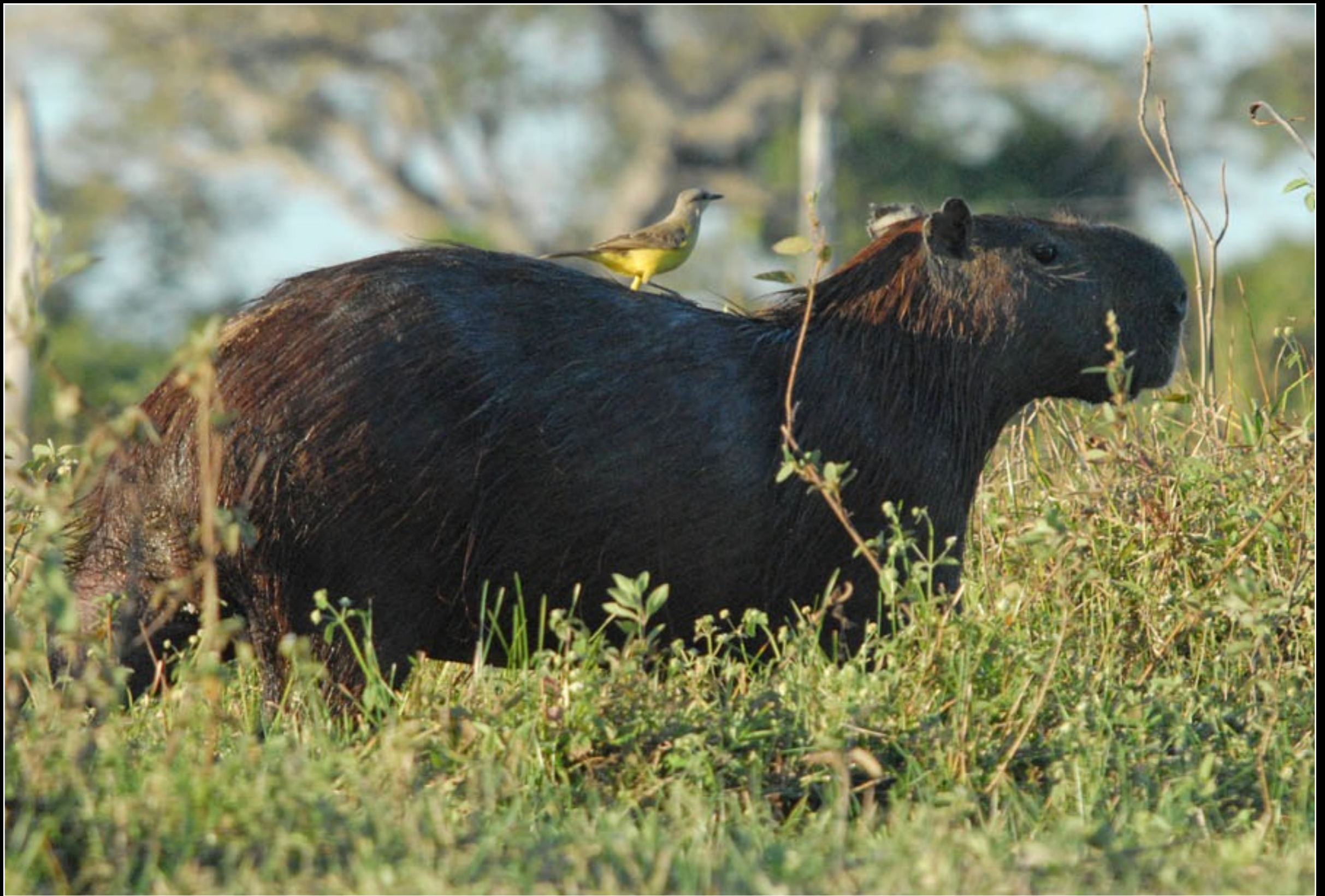
Capybara Hydrochaeris hydrochaeris Capybara Family HYDROCHAERIDAE