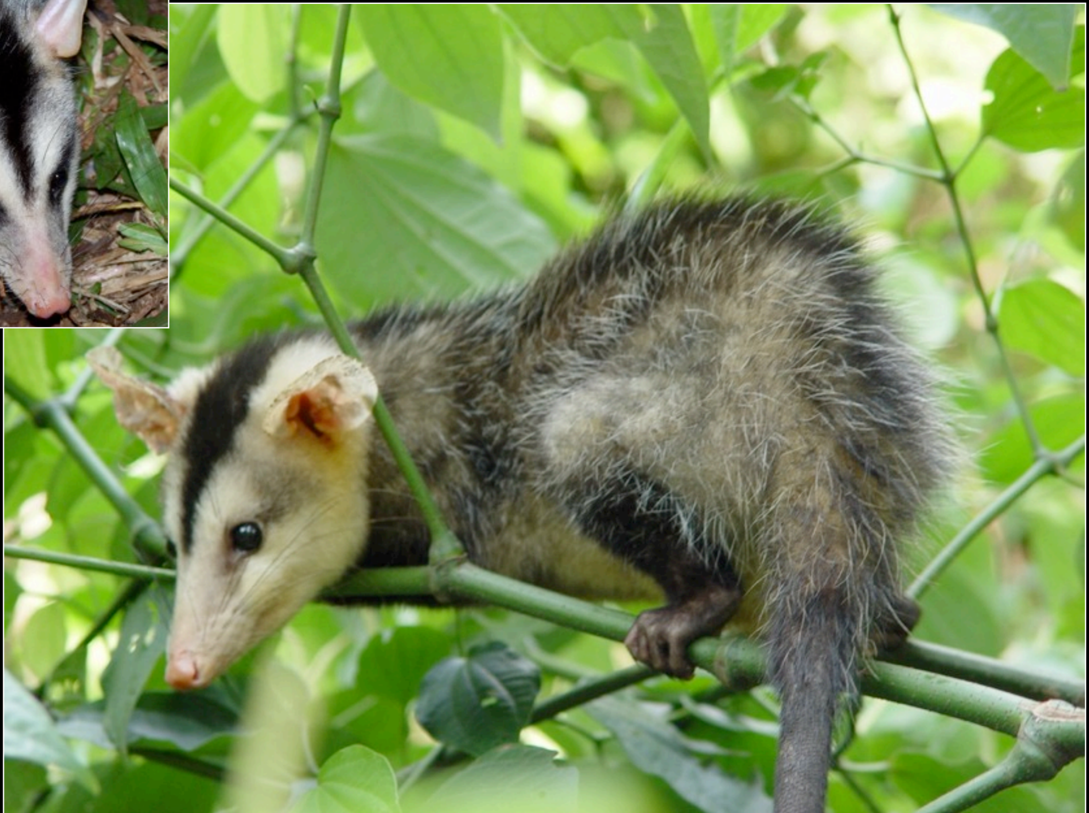
White-eared Opossum Didelphis albiventris Opossum Family DIDELPHIDAE