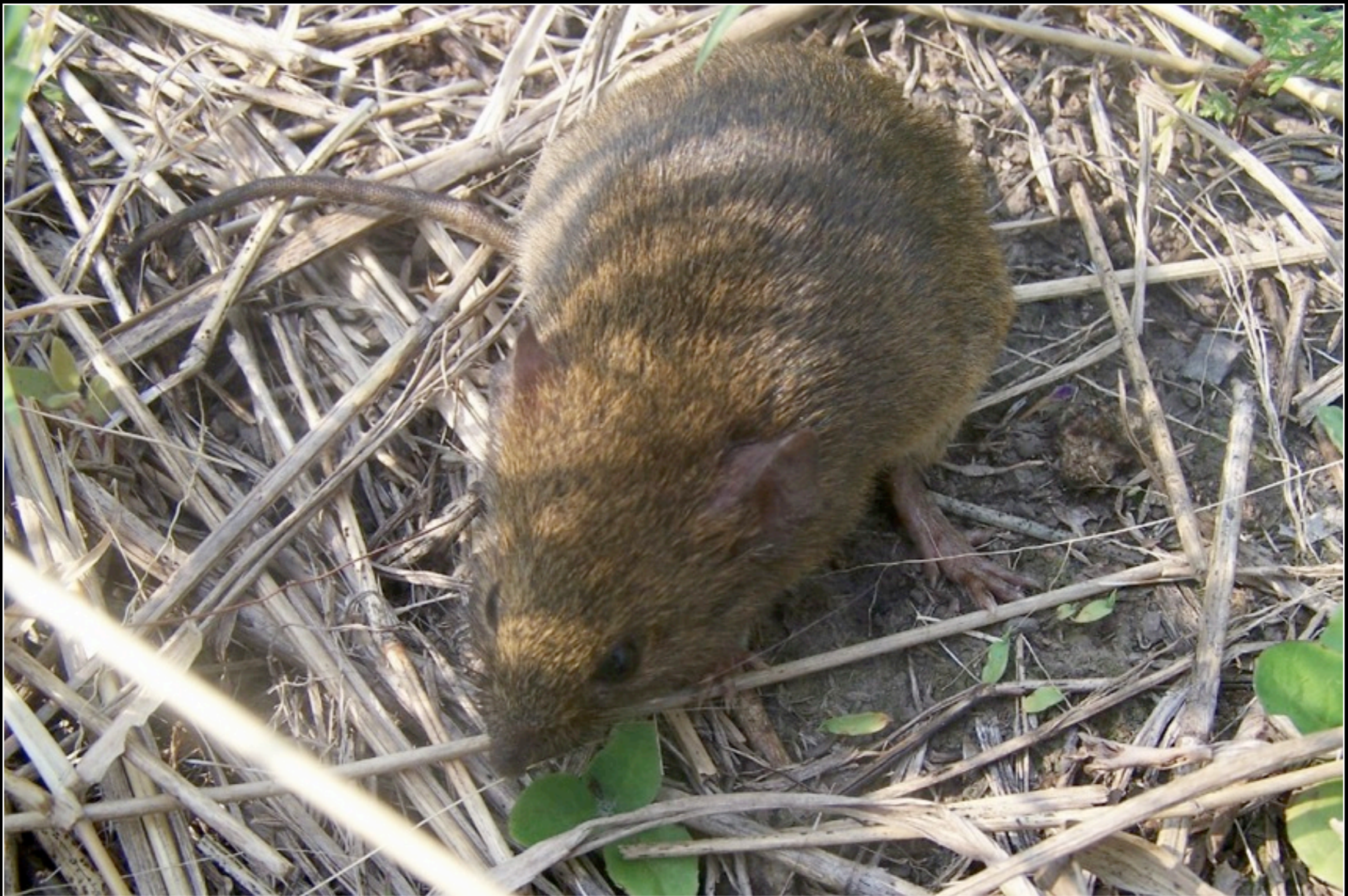
Chaco Grass Mouse - Akodon toba

New World Rats & Mice Family - CRICETIDAE or MURIDAE