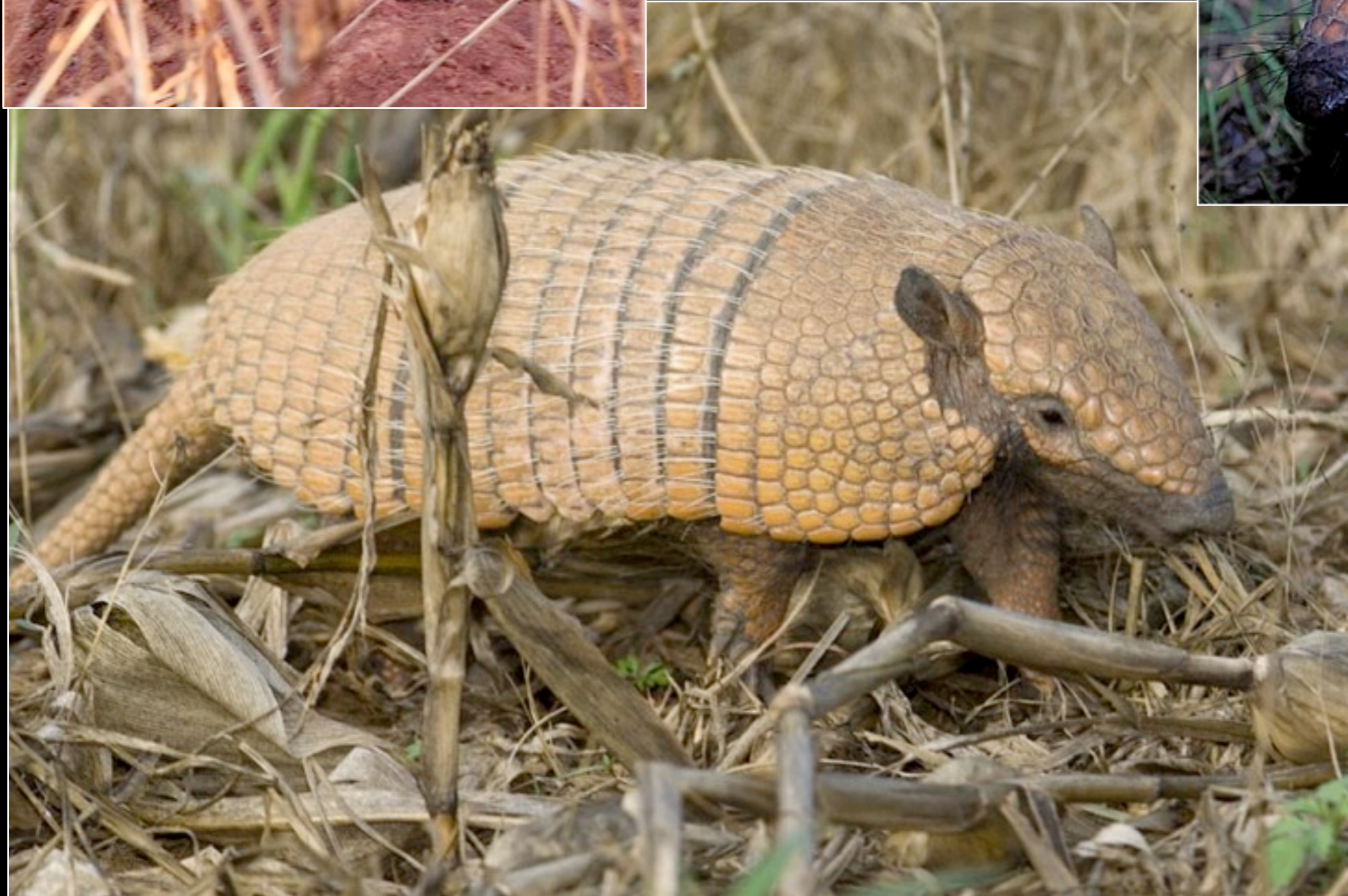
Six-banded Armadillo Euphractus sexcinctus Armadillo Family DASYPODIDAE