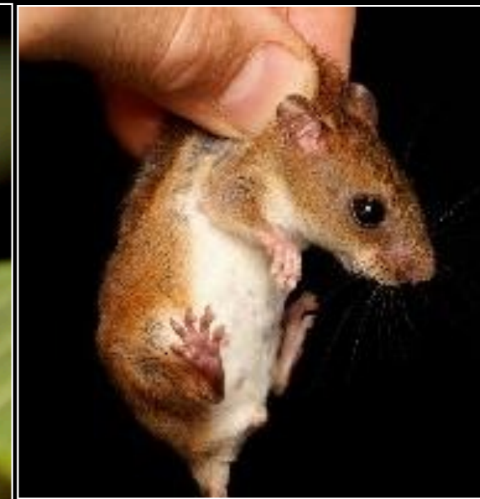
White-bellied Oecomys or Bicolored Arboreal Rice Rat Oecomys bicolor

New World Rats & Mice Family - CRICETIDAE or MURIDAE