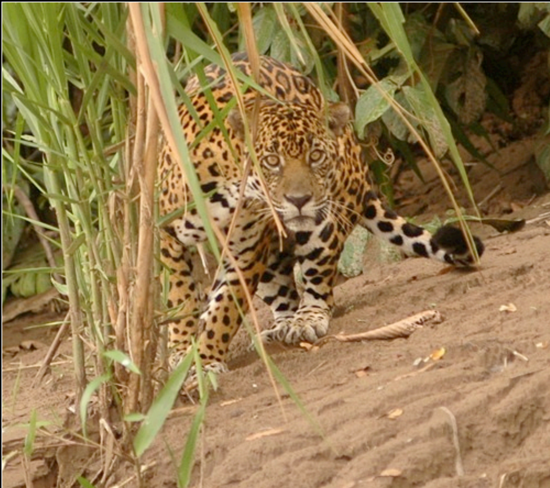
Jaguar Panthera onca Cat Family FELIDAE