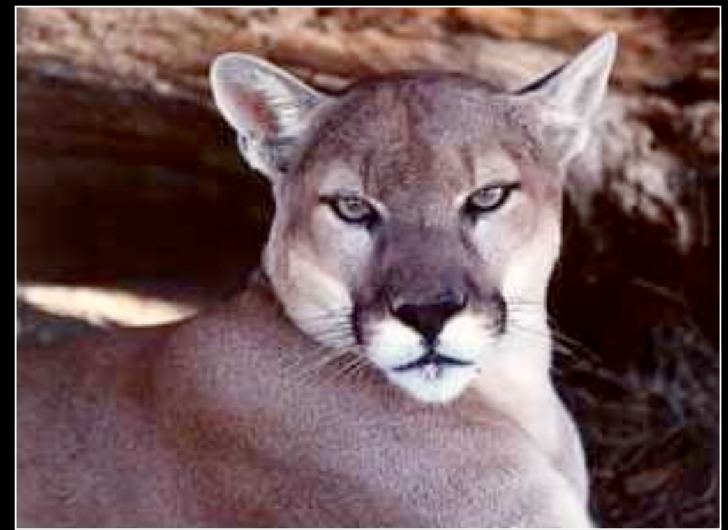
Puma Felis concolor Cat Family FELIDAE