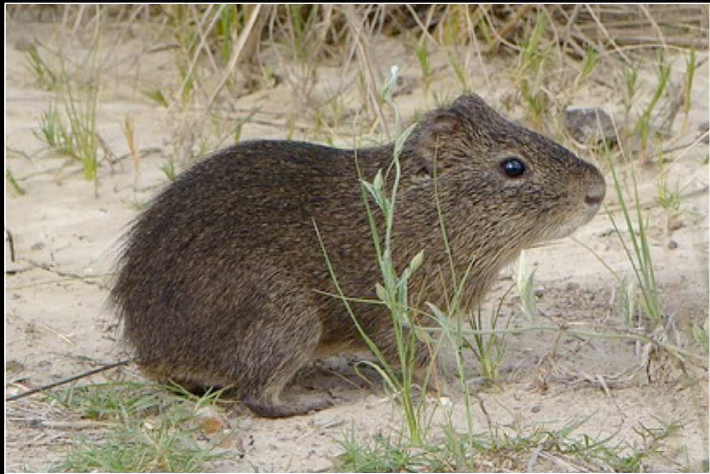
Brazilian Guinea Pig Cavia aperea Guinea Pig Family CAVIIDAE