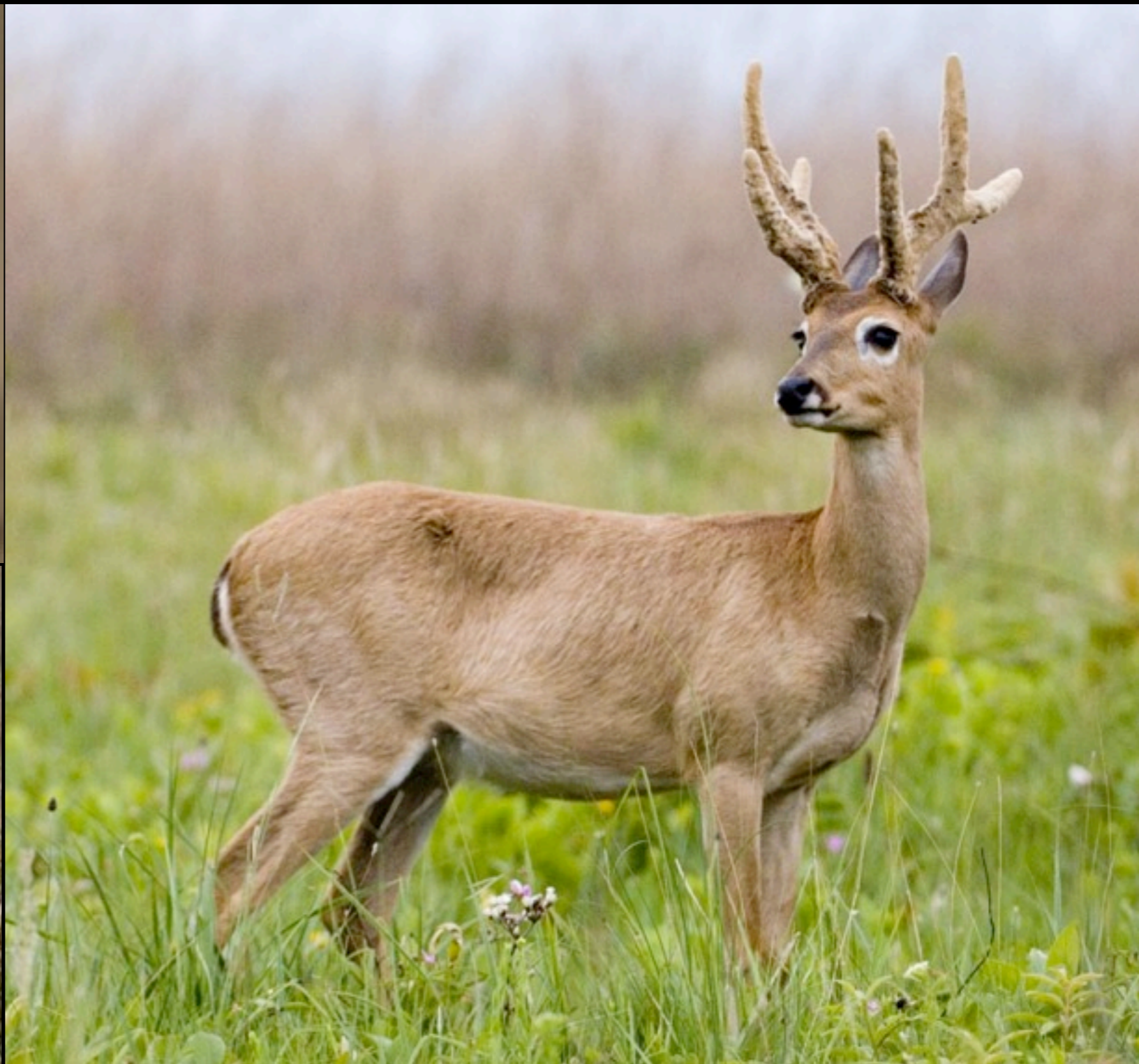
Pampas Deer Ozotocerus bezoarticus Deer Family CERVIDAE