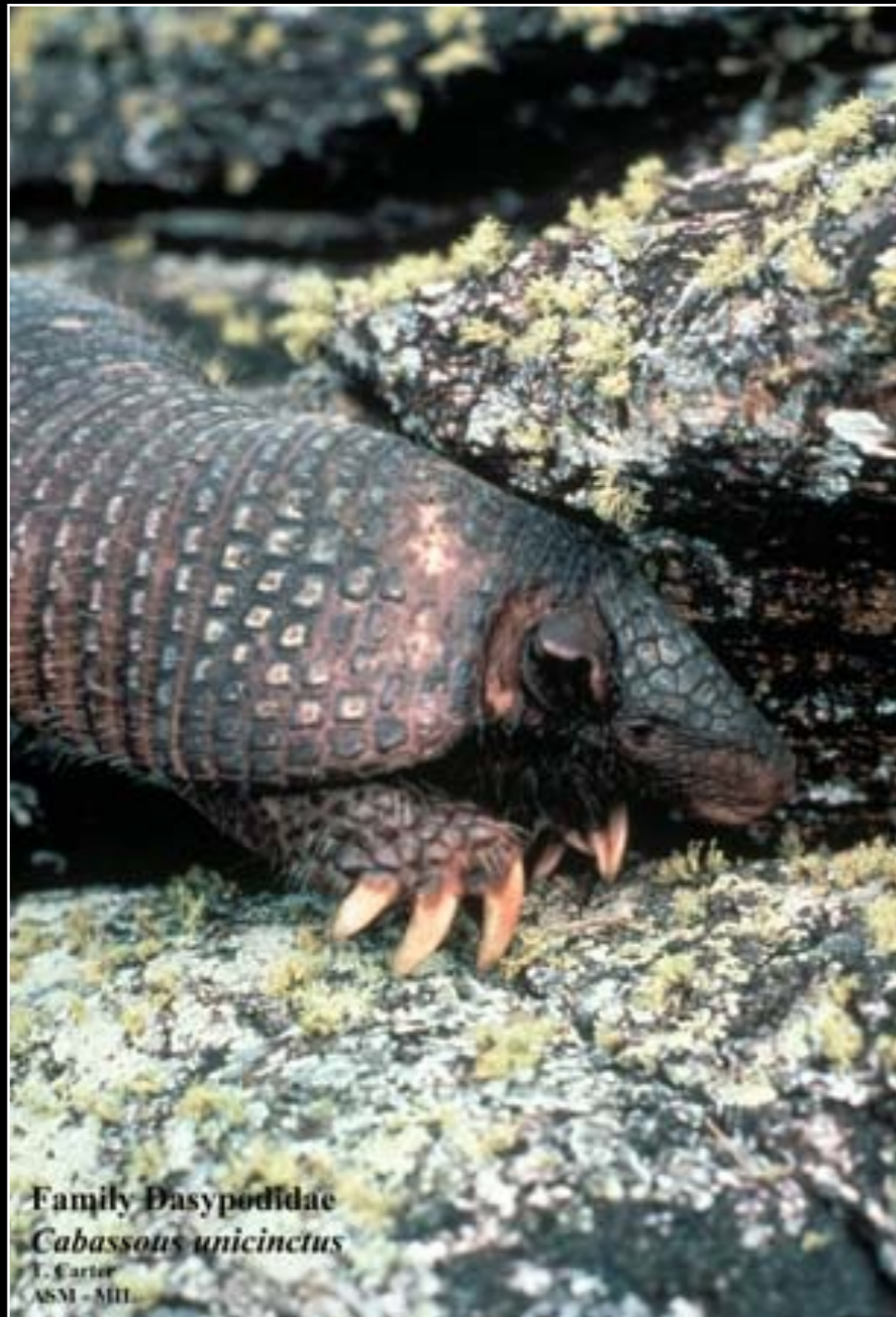
Family Dasypodidae Cabassous unicinctus T. Carter ASMI - MII