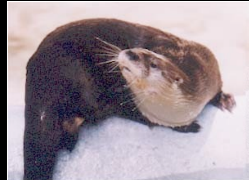
Neotropical River Otter Lontra longicaudis Weasel Family MUSTELIDAE