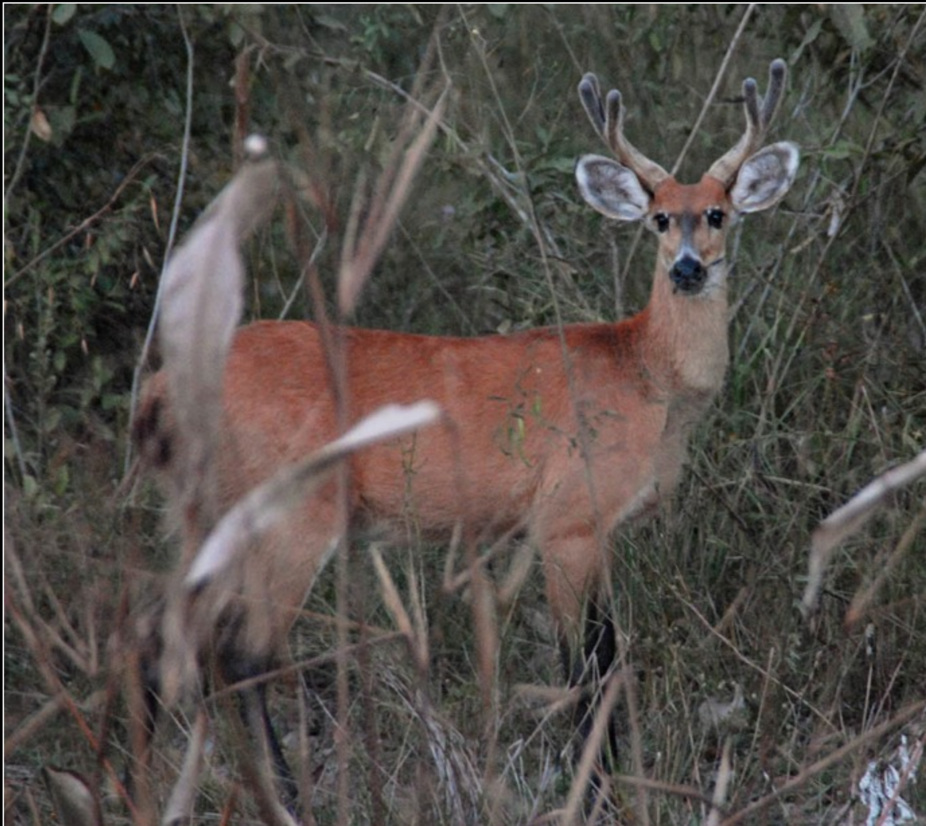
Marsh Deer Blastocerus dichotomus Deer Family CERVIDAE