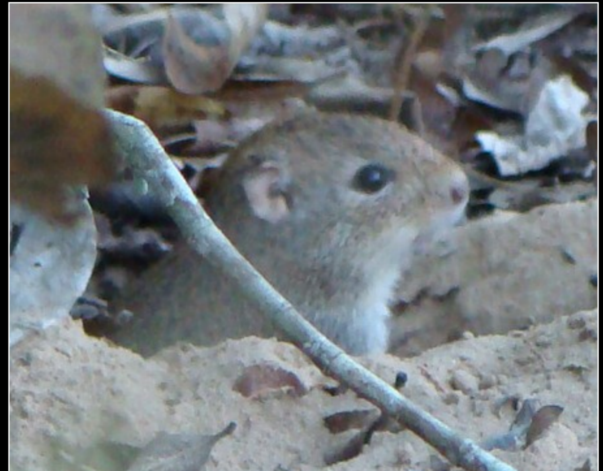
Broad-headed Spiny-Rat Clyomys laticeps