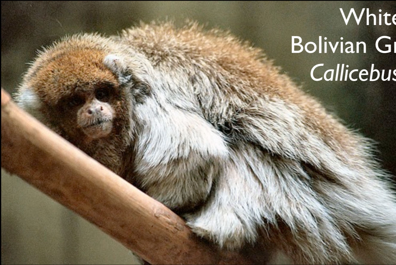
White-eared or Bolivian Gray Titi Monkey Callicebus donacophilus