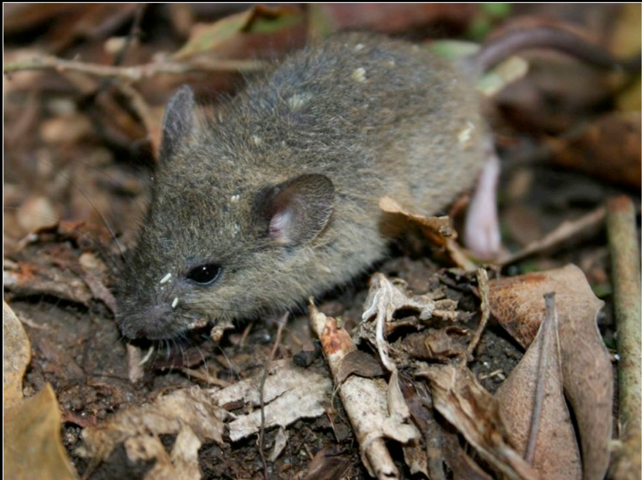
Azara's Broad-headed Oryzomys or Large-headed Rice Rat Hylaeamys megacephalus

New World Rats & Mice Family - CRICETIDAE or MURIDAE