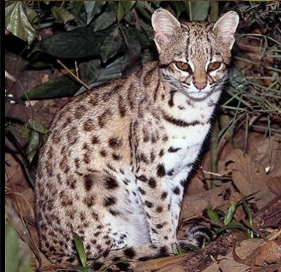
Margay Leopardus wiedii Cat Family FELIDAE