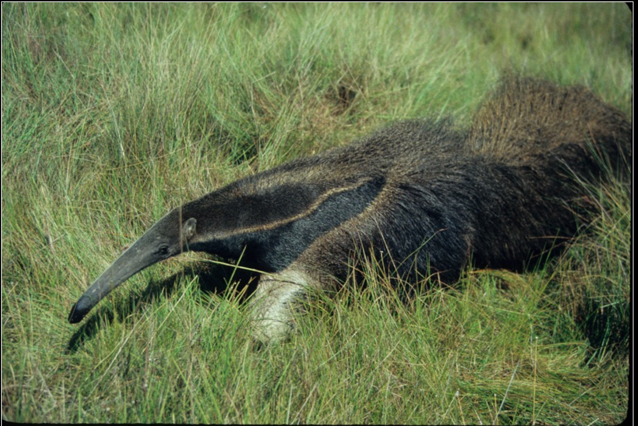
Giant Anteater Myrmecophaga tridactyla Anteater Family MYRMECOPHAGIDAE