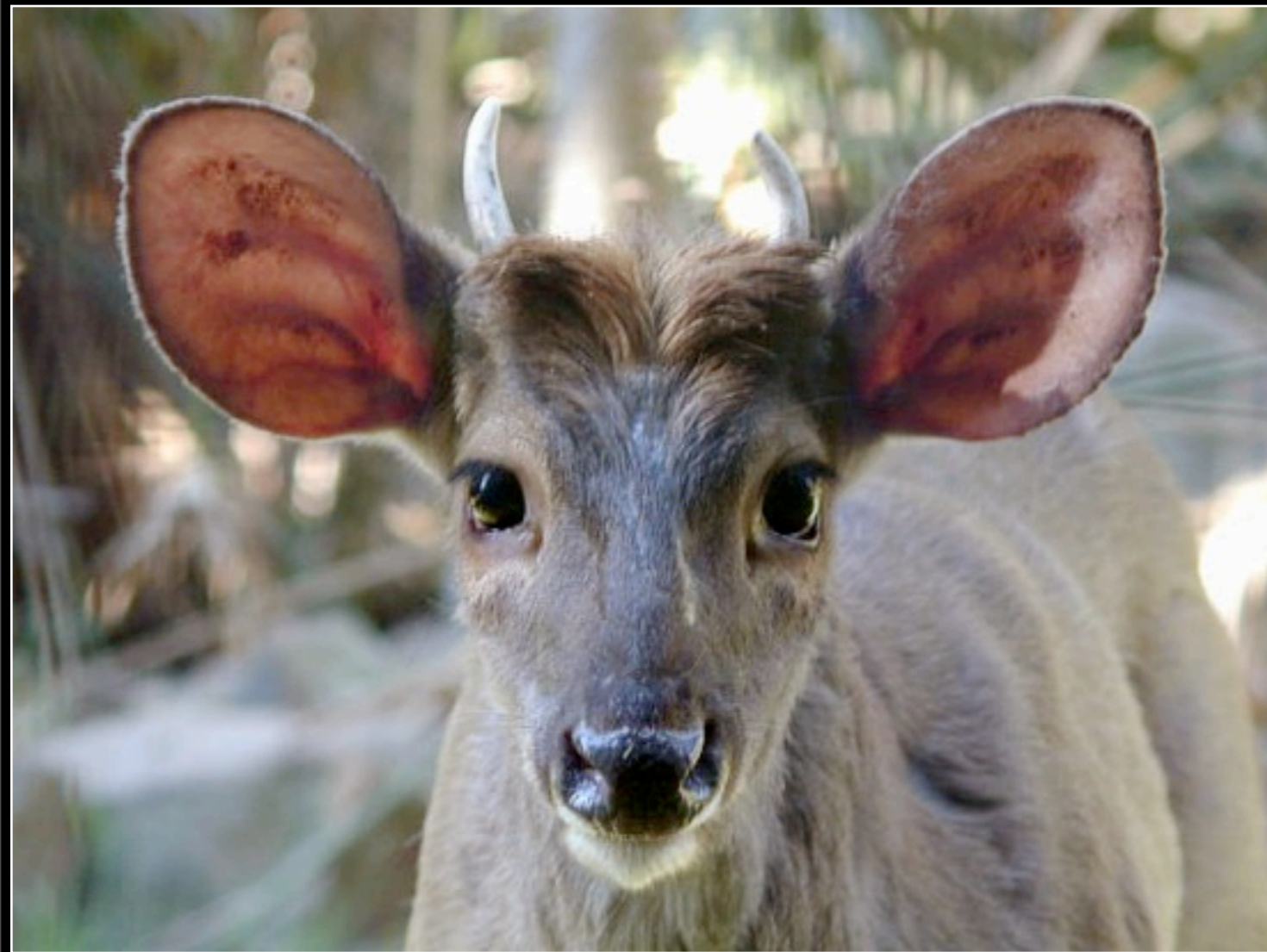
Gray Brocket Deer Mazama gouazoubira