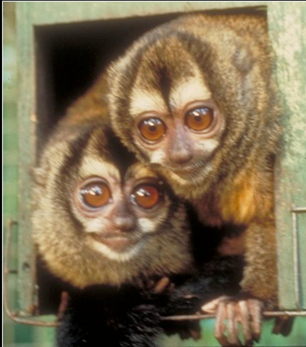
Family Cebidae Aotus azarai