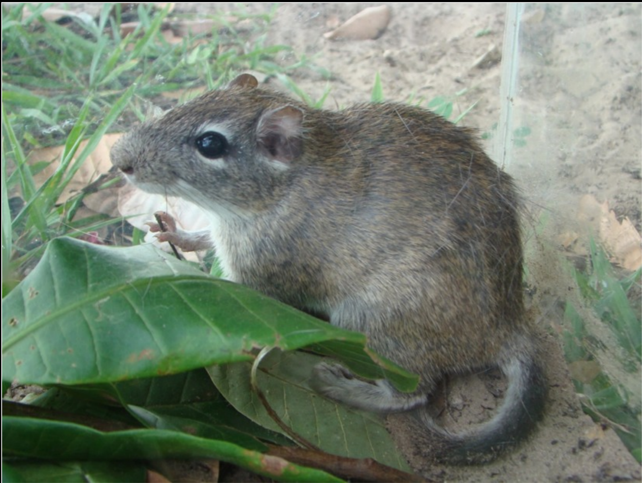
Paraguayan Punaré - Thrichomys pachyurus Spiny Rat & Tree Rat Family ECHIMYIDAE