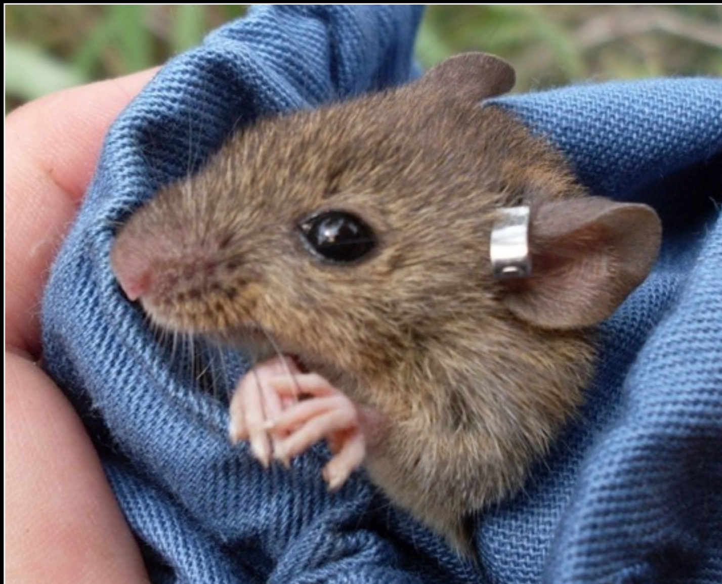
Black-footed Colilargo or Black-footed Pygmy Rice Rat Oligoryzomys nigripes

New World Rats & Mice Family - CRICETIDAE or MURIDAE