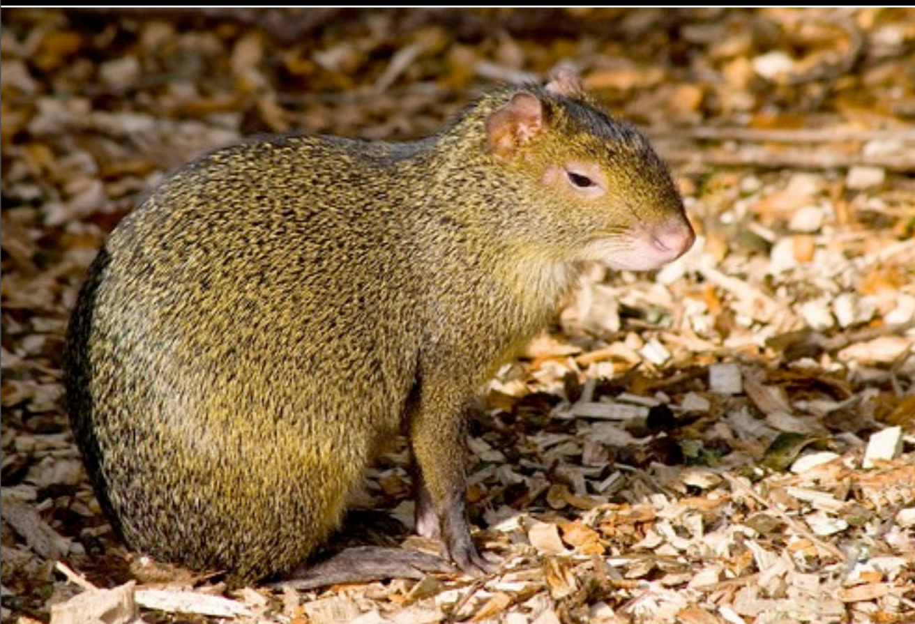
Green or Azara's Agouti Dasyprocta azarae