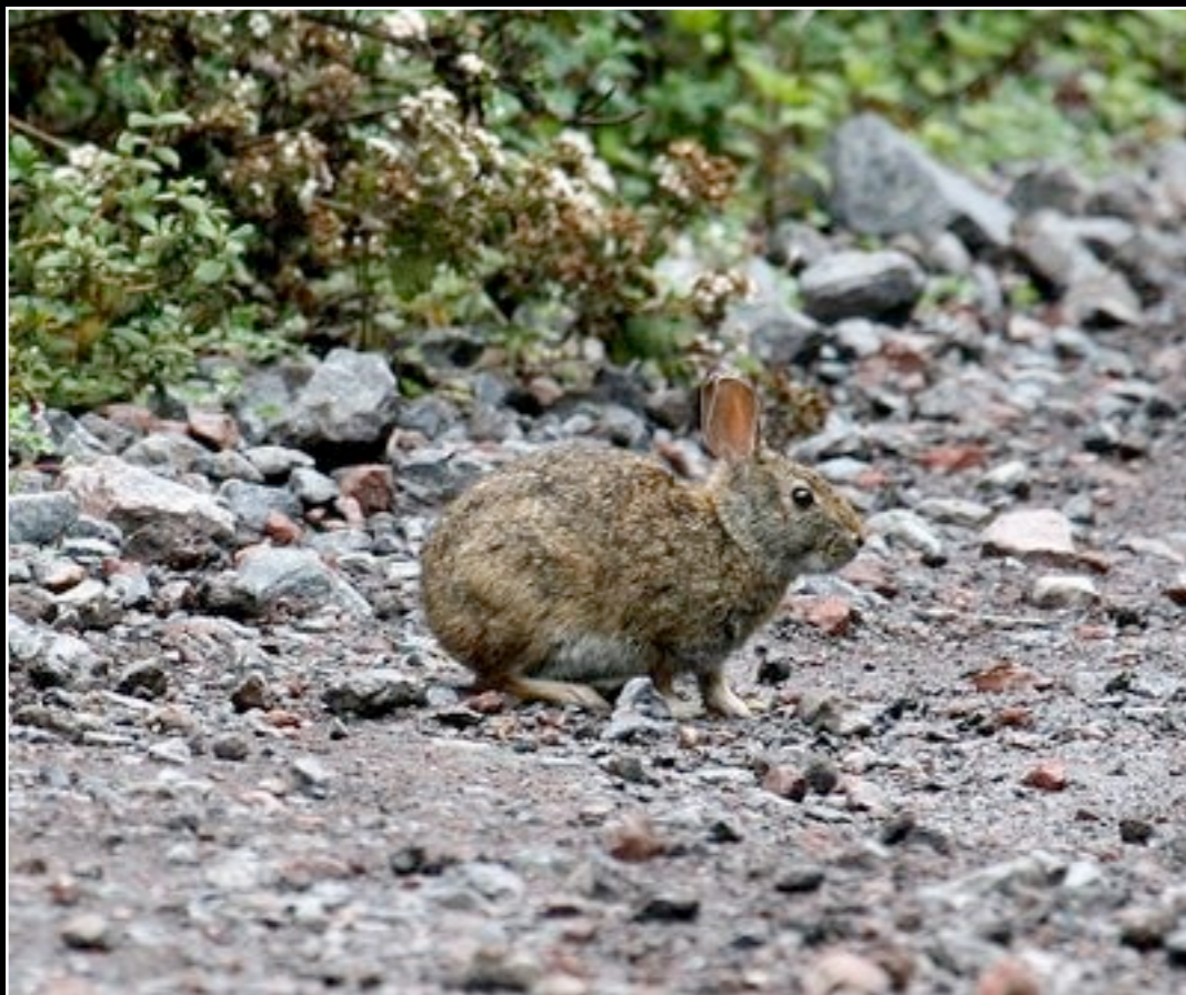
Brazilian Rabbit Sylvilagus brasiliensis Rabbit Family LEPORIDAE