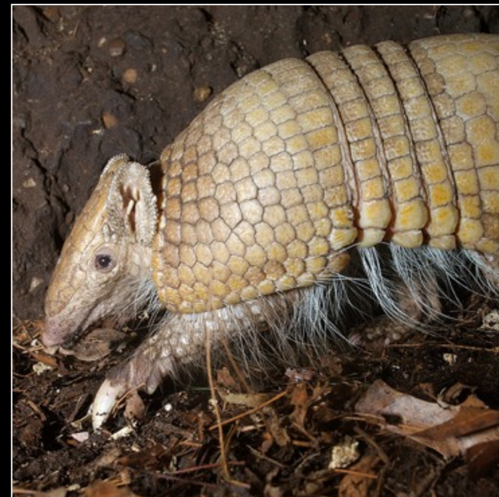
Southern Three-banded Armadillo Tolypeutes matacus