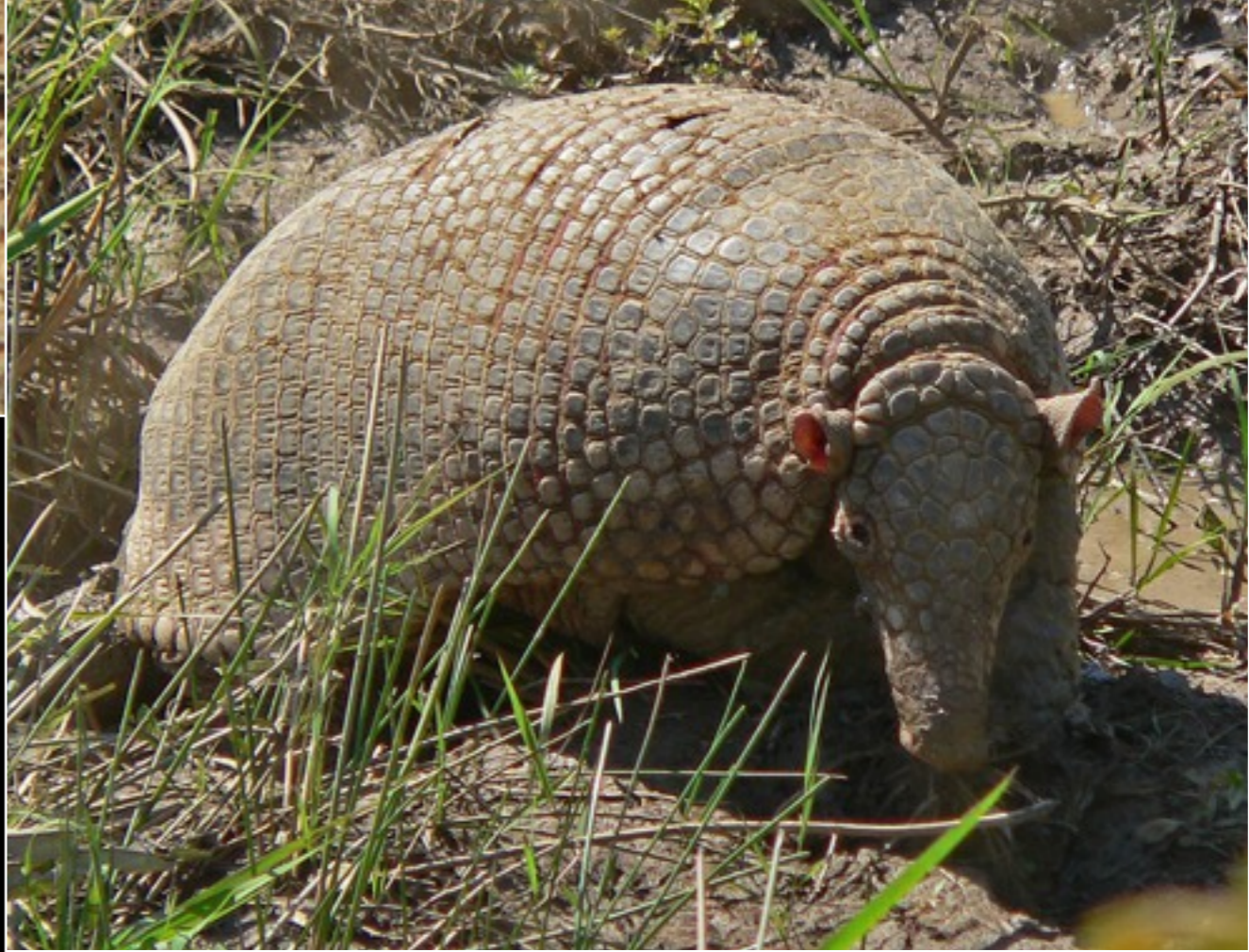
Giant Armadillo Priodontes maximus Armadillo Family DASYPODIDAE