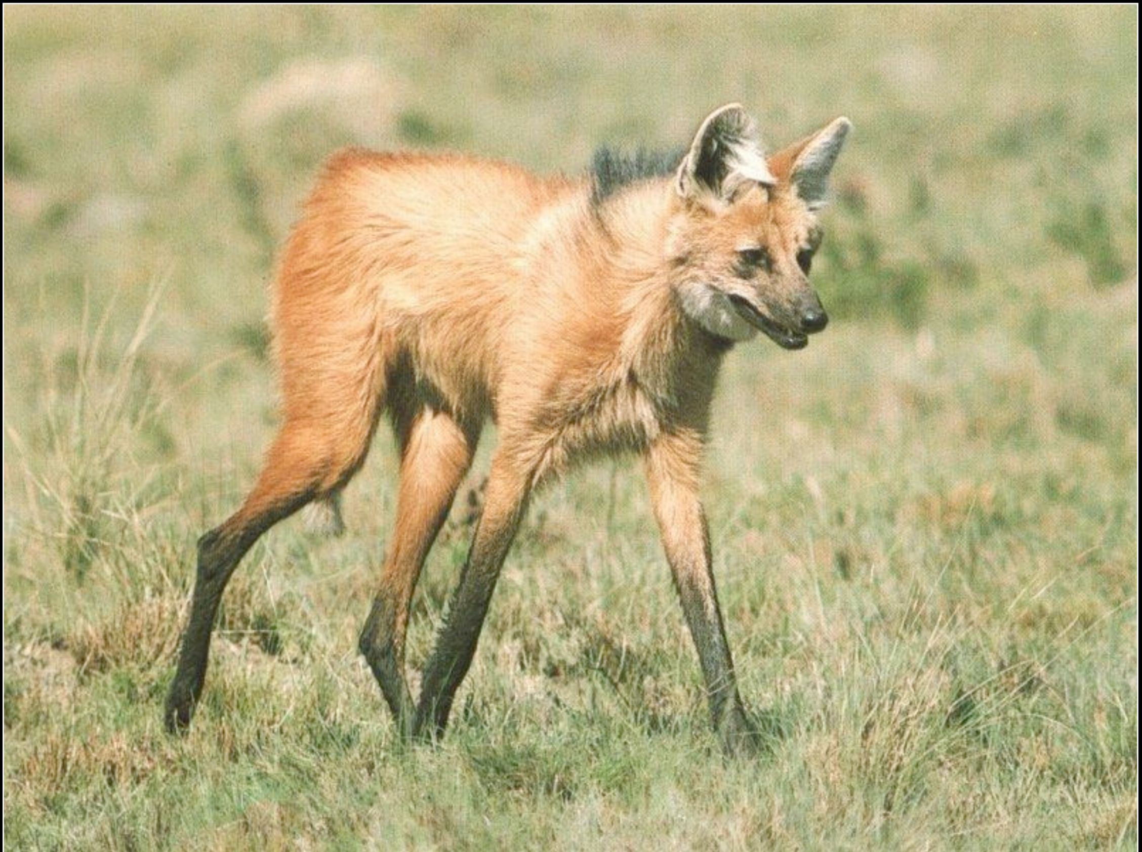
Maned Wolf Chrysocyon brachyurus Dog Family CANIDAE