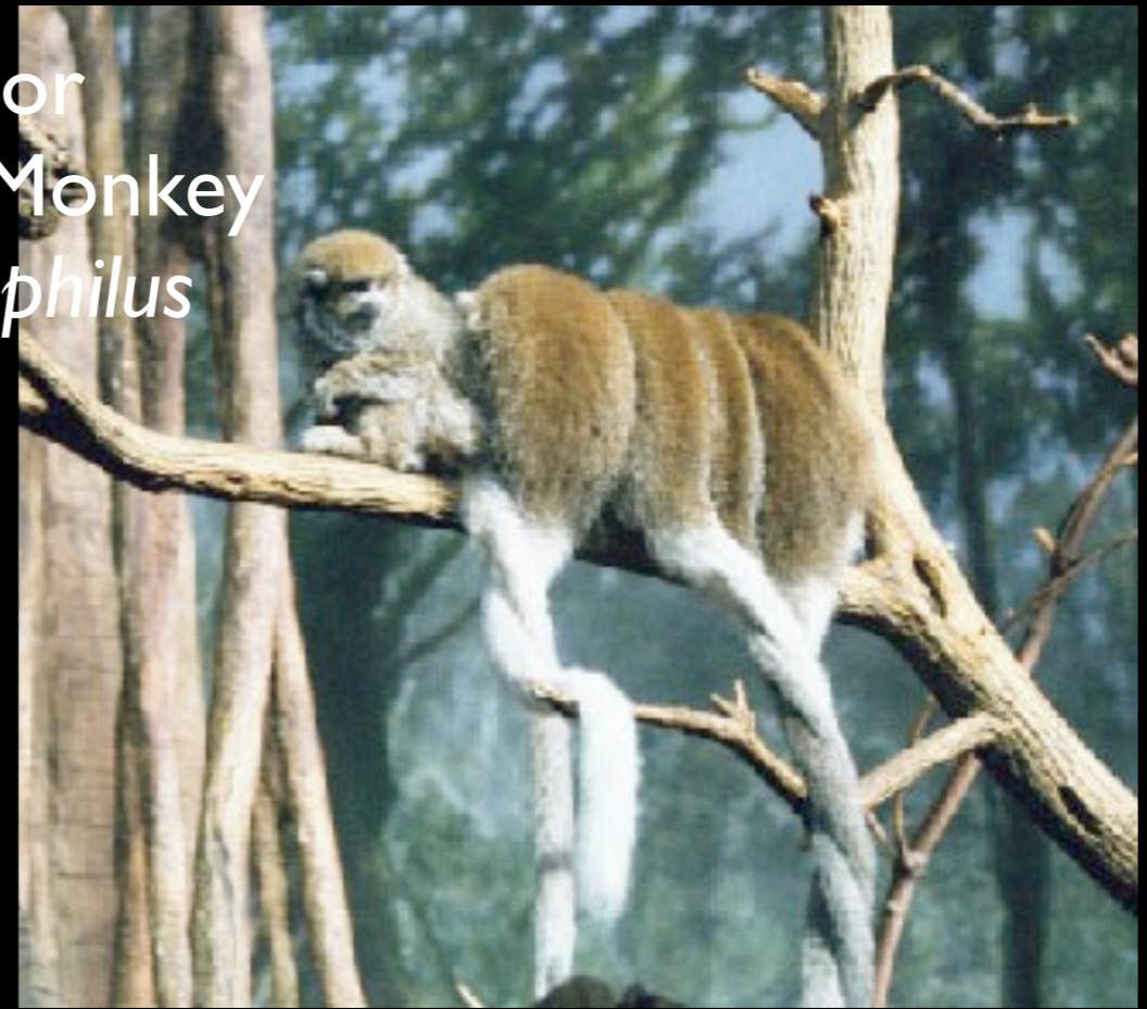
Monkey Family CEBIDAE