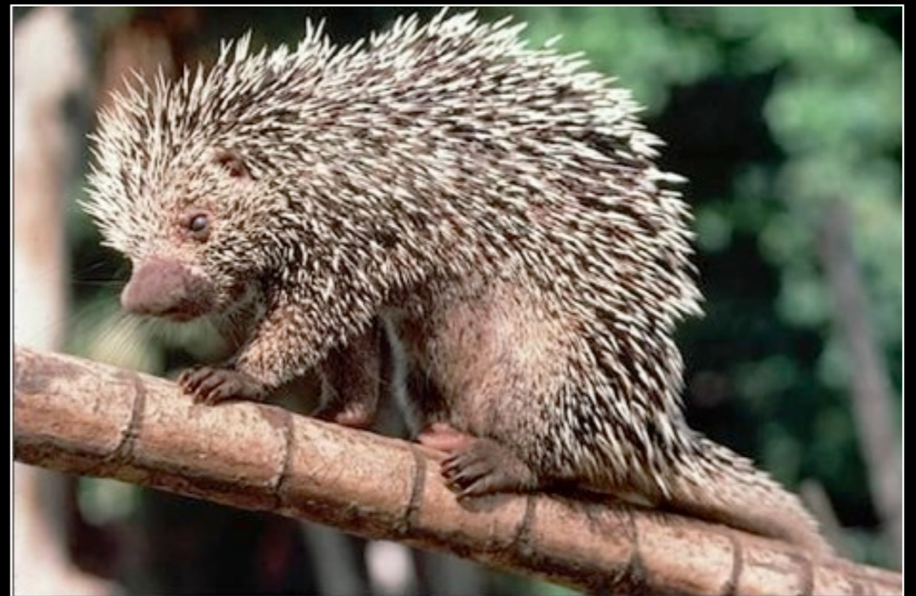
Brazilian Porcupine Coendou prehensilis New World Porcupine Family ERETHIZONTIDAE