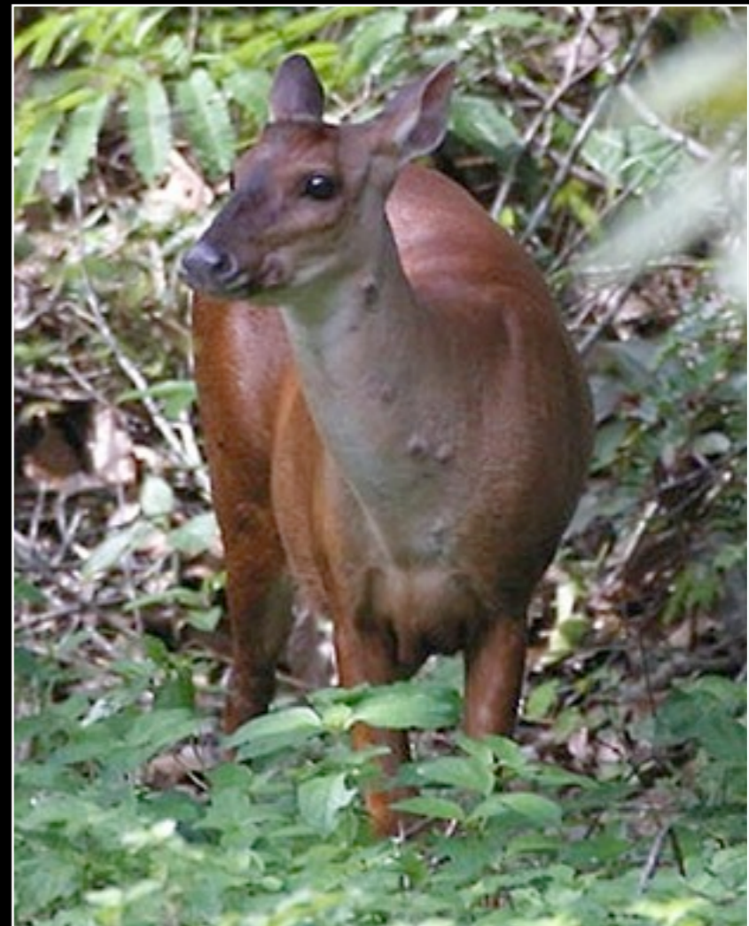
Red Brocket Deer Mazama americana Deer Family CERVIDAE