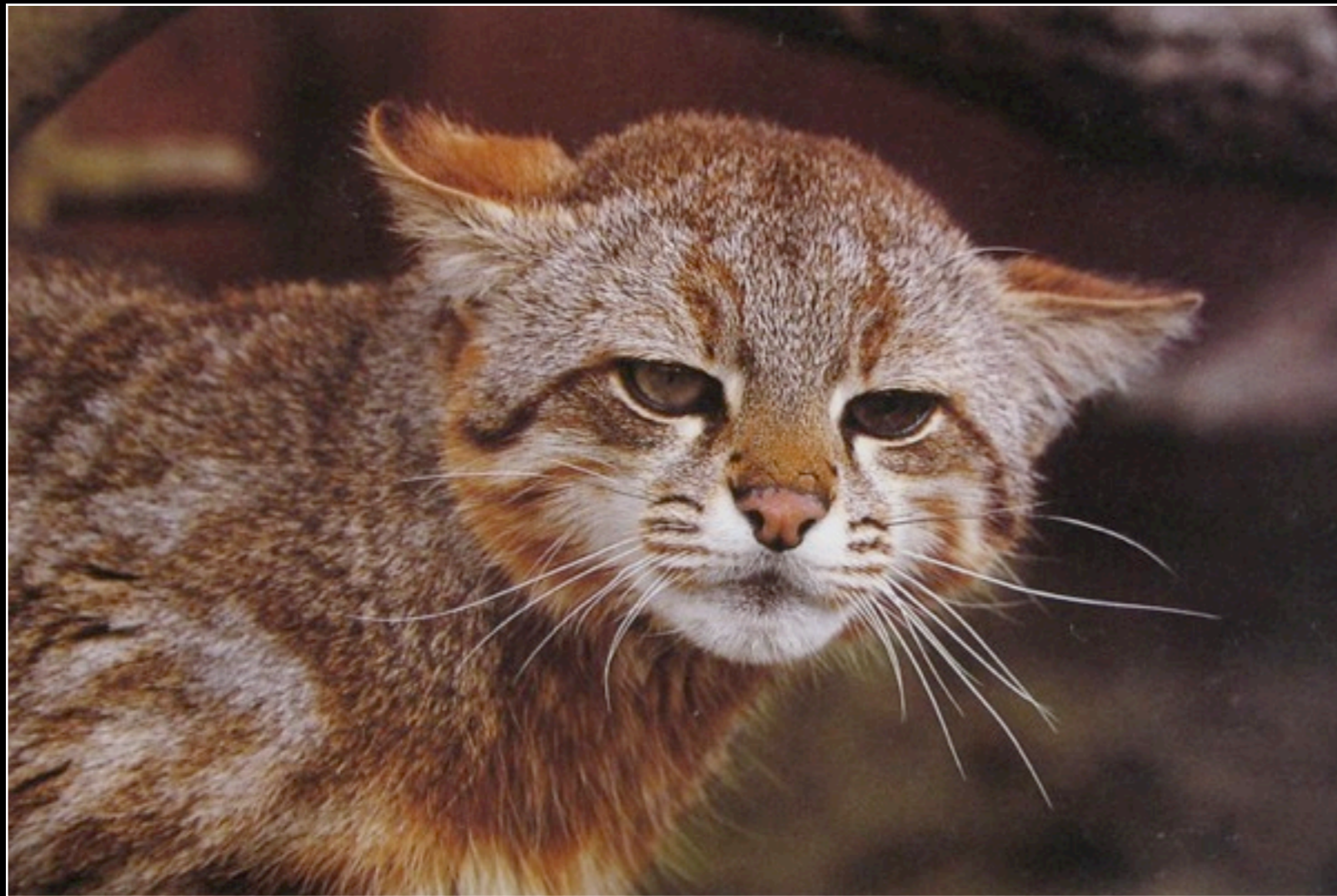
Pantanal Cat Leopardus braccatus