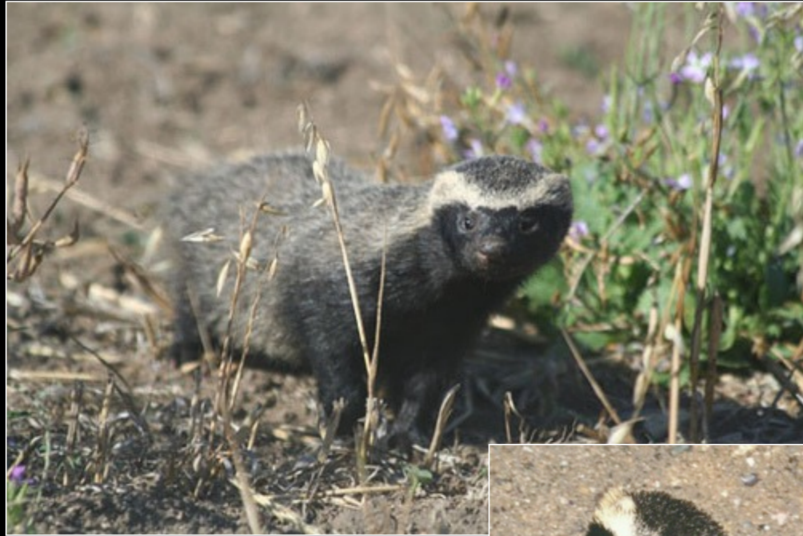
Lesser or Southern Grison Galictis cuja