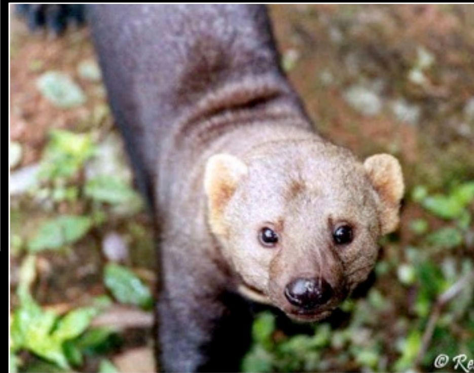
Tayra Eira barbara Weasel Family MUSTELIDAE