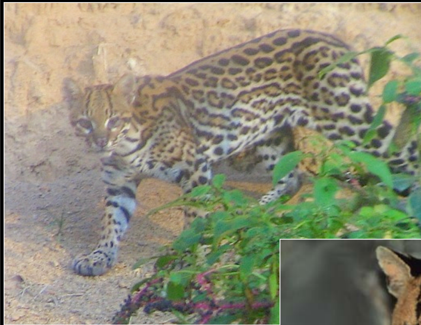
Ocelot Leopardus pardalis