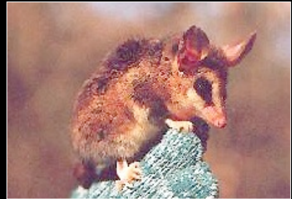
White-bellied Woolly Mouse Opossum Micoureus constantiae Opossum Family DIDELPHIDAE