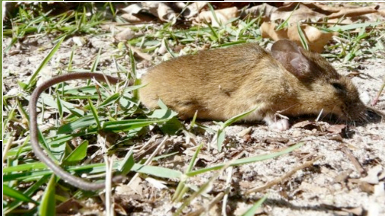
Fornes' Colilargo or Fornes' Pygmy Rice Rat Oligoryzomys fornesi

New World Rats & Mice Family - CRICETIDAE or MURIDAE